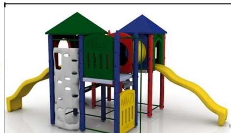
With Climbing Wall Option